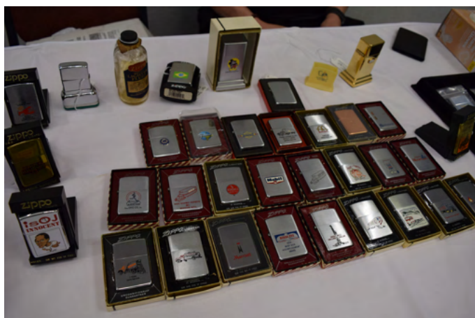
Some nice Zippos