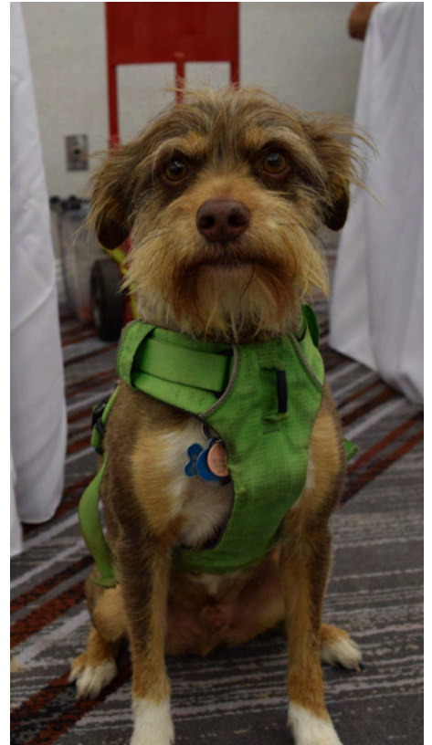
Greg Ryman's cute dog Flynn - we all loved him!