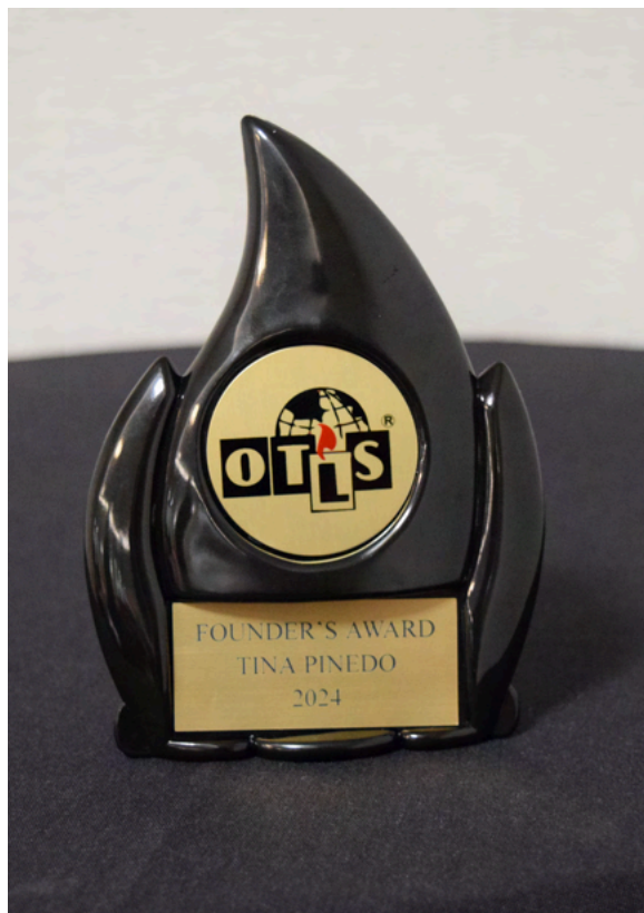
OTLS Founders Award