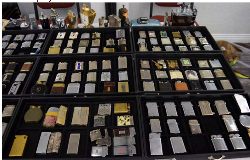
Some great lighters here