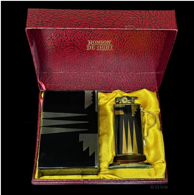
Gold Plate with Black Enameled "Modernistic" Design Set

Now let's take a look at these fantastic, extremely rare sets!