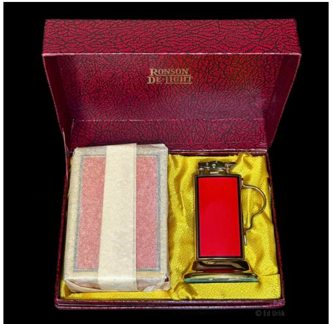
Gold Plate with Red & Black Stripe Enameled Set