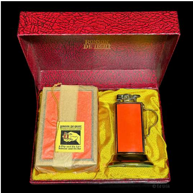
Gold Plate with Orange & Black Stripe Enameled Set – Ronson Catalog No. 12739