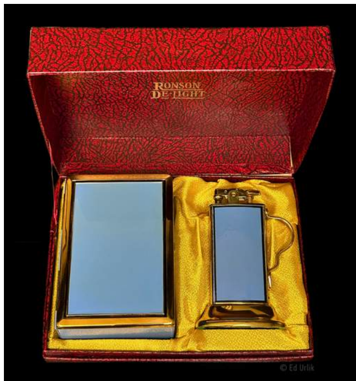
Gold Plate with Black & Red Stripe Enameled Set