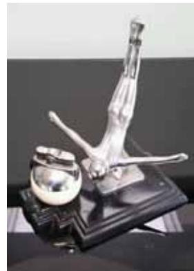
Ronson art deco figural lighter March 2016 $527.