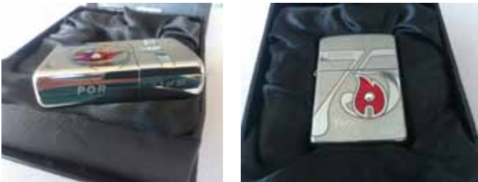
75th Anniversary POR 1/50 Limited Edition Zippo Lighter Brand New in Original Box April 2016 $7,000.