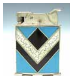
Art Deco Evans Roller Bearing Blue Black White Enamel Cigarette Lighter February 2016 $293.