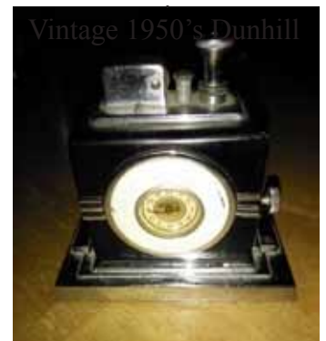
Ronson Touch Tip Clock Lighter March 2016 $385