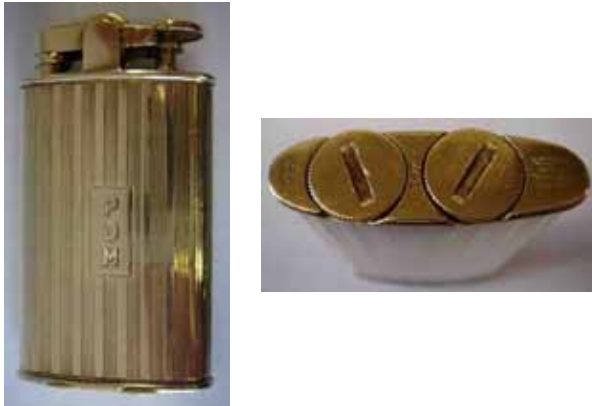
1928 TIFFANY Junior Sport De-Light in 14K (Carat) SOLID Gold April 2016 $2000.