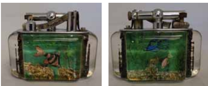
Aquarium Fish Perspex Petrol Table Lighter April 2016 $1500.