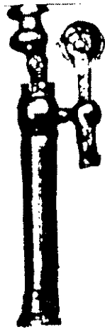
First World War lighter made from a bullet case.