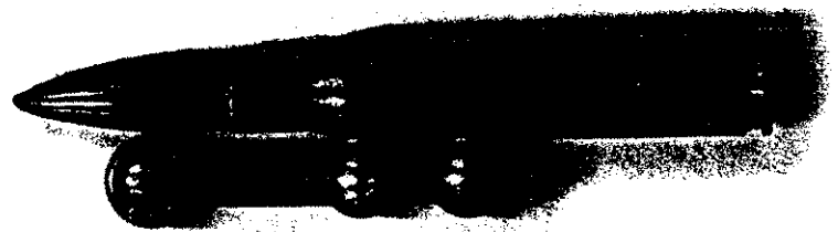
This particular lighter is not a photo, but a xerox of an actual lighter from your Editor's collection.