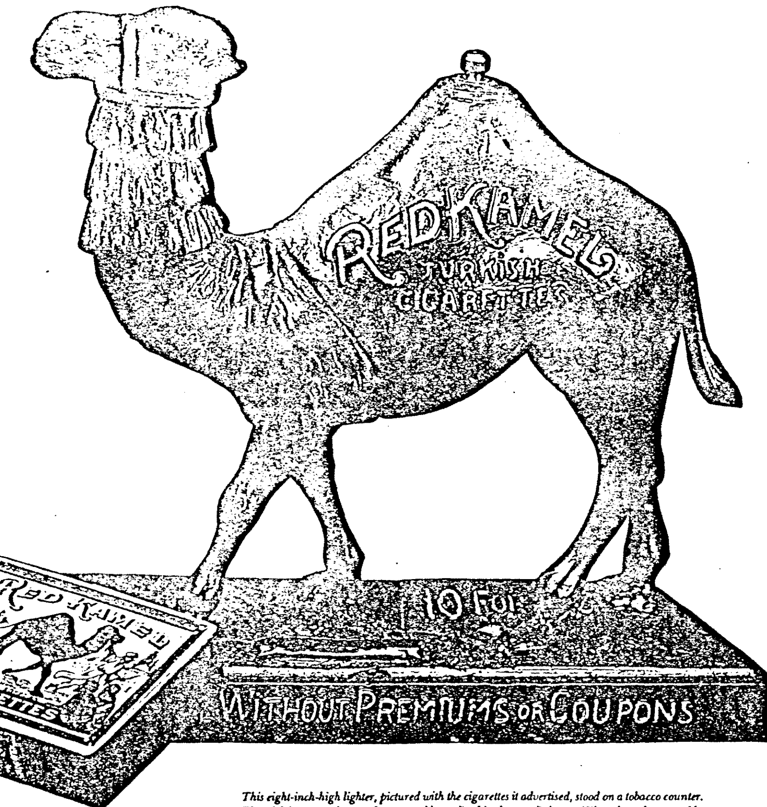
This eight-inch-high lighter, pictured with the cigarettes it advertised, stood on a tobacco counter. The wick is wrapped around a removable steel rod in the camel's hump. When the rod, grasped by the gold ball, was struck against a strip of flint near the forelegs, the wick flamed.

I'm still working my way through the set of books called THE ENCYCLOPEDIA OF COLLECTIBLES and have run into another really fascinating lighter. See below. This "Kamel" is red colored in the book. Can you imagine one of the cigarette companies giving these away? If anyone has access to this lighter I would definitely buy it - your editor.