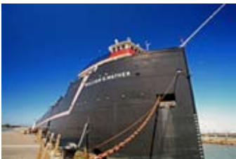
Steamship William G. Mather