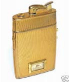
Evans Caselightner Watch - $68