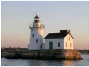
West Point Lighthouse