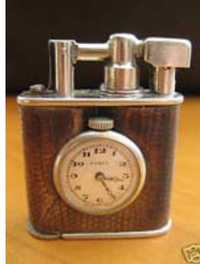
European Liftarm - $131