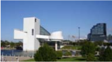
Rock & Roll Hall of Fame