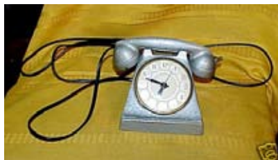
Timelite Clock Electric Lighter - $36