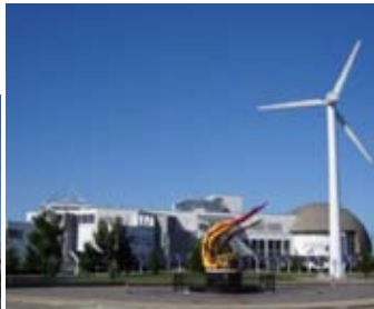
Great Lakes Science Center