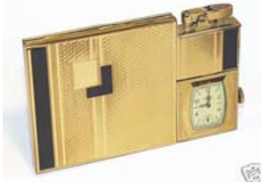
Ronson Kingcase with Watch - $485