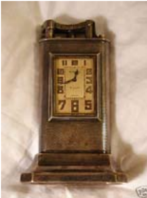
Sterling Dunhill Table Clock - 1920

Have fun collecting watch lighters at this time.