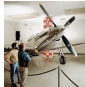
Crawford Auto and Airplane Museum