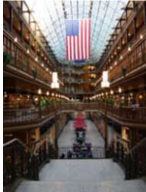
Terminal Tower Arcade