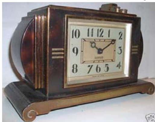
Ronson Large Clock Touchtip - $456