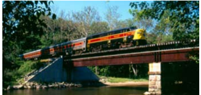
Cuyahoga Valley Scenic Train