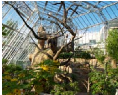
Botanical Gardens - Cleveland