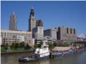
Cuyahoga River - Cleveland