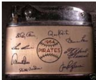
1964 Pittsburgh Pirates - $142