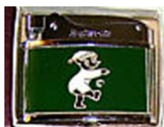
Travel Lodge - $34