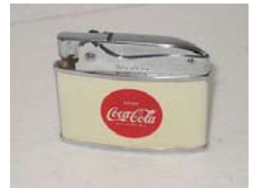
Coke - $72