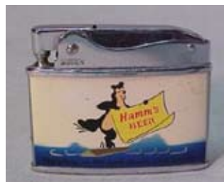
Hamms Beer - $75