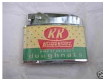
Krispy Kreme Doughnuts - $54