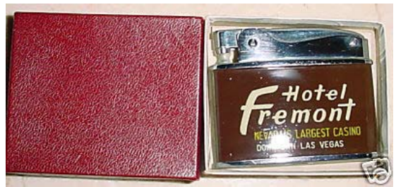
Hotel Fremont Casino - $104

The typical Japanese made flat advertiser is actually a copy of the Ronson Adonis first invented by Frederick Kaupmann in 1945. Flats first became important in the mid 1950's and are still manufactured today. Vintage flat ad lighters are important cross collectibles and have maintained strong value in todays soft economy. Sports - casino - beer and soda advertisers still rank as best. Serious collectors like the flats in mint condition. Flats are fun and colorful and can also be easily found in flea markets and antique shows. As many top business people state - "it pays to advertise".