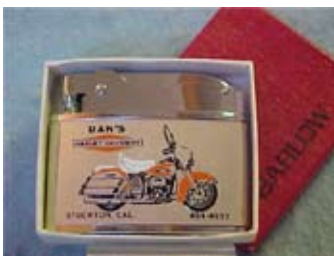
Harley Motorcycle MIB - $76