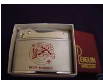
Reddy Kilowatt - $47