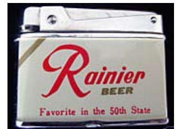
Rainier Beer - $77