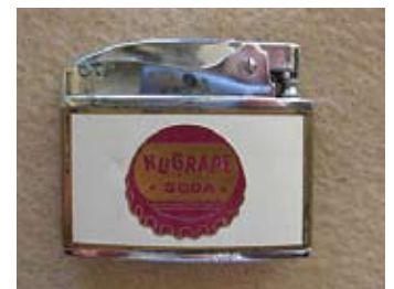
Nugrape Soda - $41