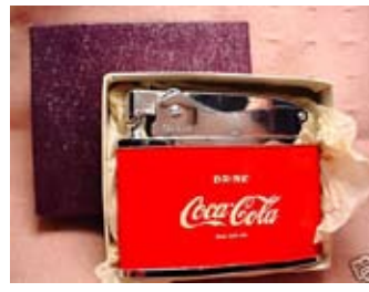
Coke - $68