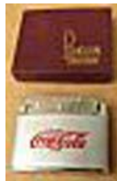
Coke - $62