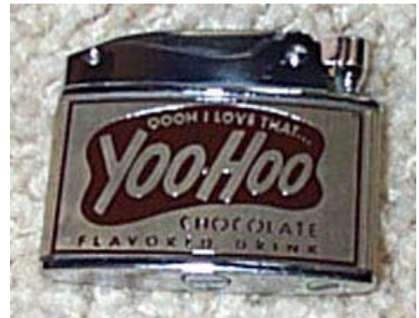
Yoo Hoo Yogi Berra - $449