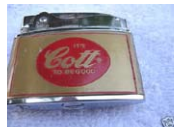
1964 Pittsburgh Pirates - $142