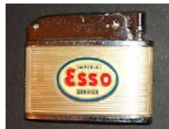
Esso Gas - $20