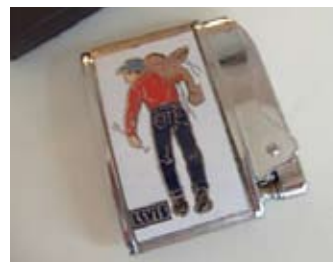
Levis Jeans - $105