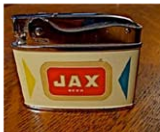
Jax Beer - $35