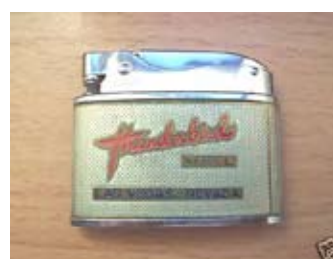
Thunderbird Casino - $202