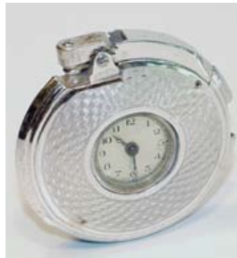
Here is a round Ronson, watch lighter. This is also a Prototype.