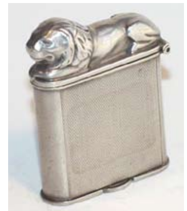
A beautiful figural Lion in Sterling. Also a snuffer